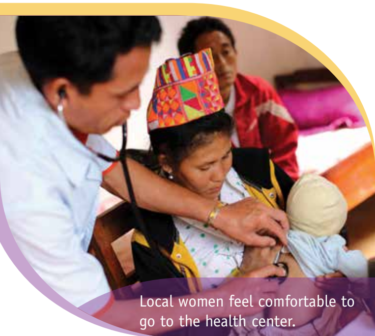
Local women feel comfortable to go to the health center.